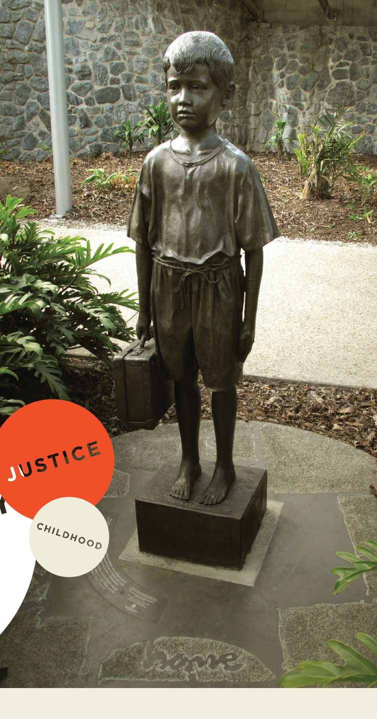
HISTORICAL ABUSE NETWORK